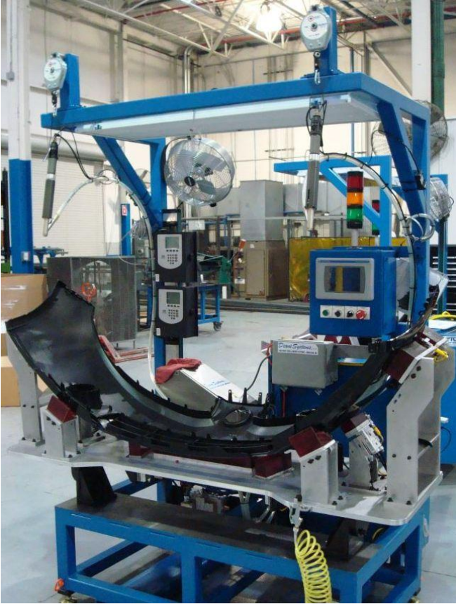
Inserting screws into fog lamps on a front fascia piece