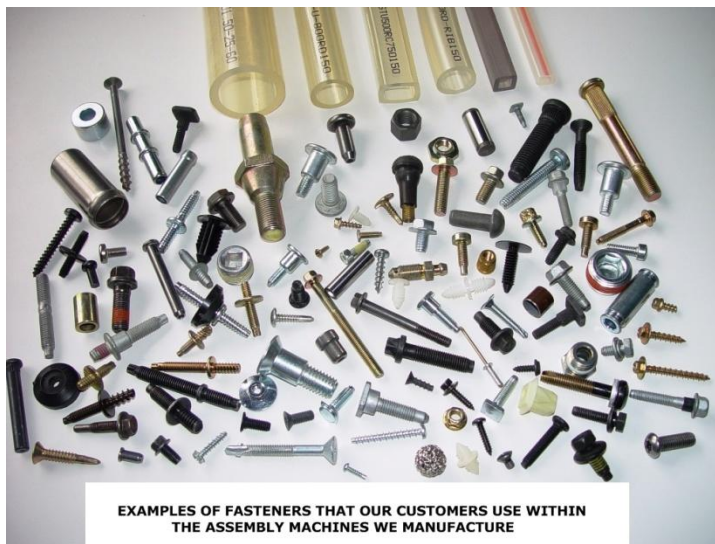
EXAMPLES OF FASTENERS THAT OUR CUSTOMERS USE WITHIN THE ASSEMBLY MACHINES WE MANUFACTURE